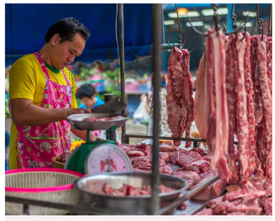
Food safety, sanitary and phytosanitary issues being addressed by the Government

Quality assurance and safety will be a key factor in enhancing productivity and ensuring public health as well. In terms of policy, the government needs support in drafting animal health-related legislation, such as amendments to the Law on Livestock Production and Veterinary Matters. One practical intervention is the creation of a dedicated training school for veterinarians, which the country currently lacks. Lastly, developments in the livestock sector have to be made in a sustainable manner protecting natural resources, particularly water and forests.