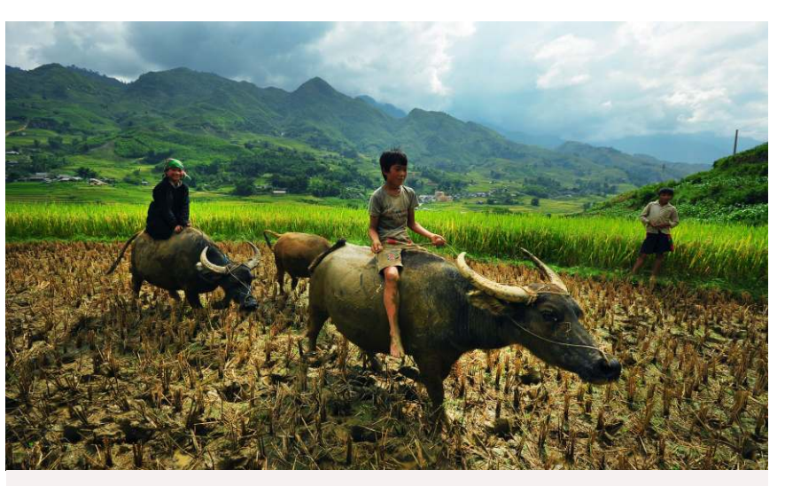
Small-holder farmers need to improve technical knowledge in livestock safety and quality

The government is also working on food safety, sanitary and phytosanitary issues concerning livestock. The Ministry of Health (MOH), with support from USAID, recently passed the Law on Food which regulates the livestock value chain. The MAF is responsible for sanitary and phytosanitary issues, while the Department of Livestock and Fisheries is responsible for animal health.